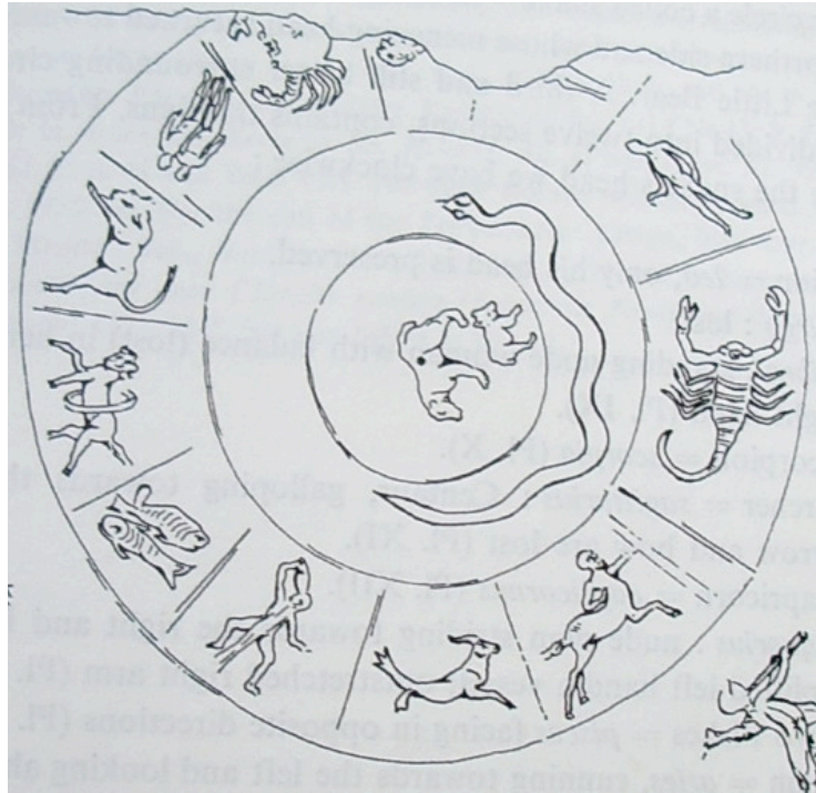
Figure 1 Detail of a stucco zodiac on the ceiling of the cult niche from the Mithraeum on Ponza. M. J. Vermaseren, Mithriaca (Leiden: Brill, 1974), p. 9, Figure 6. © Antonio Solazzi; compare Beck, Mithraism , p. 152, fig. 1.

northern side and whose menacing head is turned towards the muzzle of the Little Bear'. 18 The snake 'occupies one half of the circle lying between the zodiac and the bears on the ceiling of the Ponza Mithraeum' (See Figure 1).