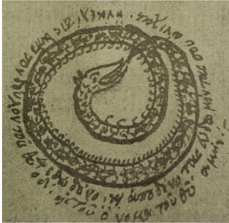
Figure 3 Illustration in an astrological text, Codex 34 (Erlangensis Ms. 93) (16 th century CE). Codices Germanicos , ed. F. Boll ('Catalogus Codicum Astrologorum Graecorum', 7; Bruxelles: Henry Lamertin, 1908), p. 246.

If medieval astrologers were cognisant of the 'nodal' dragon, it is conceivable that the two semicircular dragons biting each other's tails on an English alchemical scroll from 1588 CE (Fig. 4). 27 similarly denote