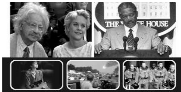
Figure 7. Small Bodies: IQ, Deep Impact, Armageddon, A Walk to Remember

There are various examples of minor astronomical bodies being used in films (Figure 7).