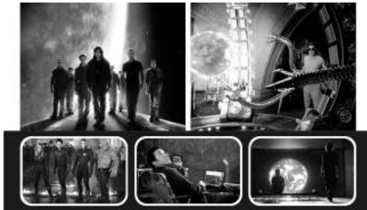
Figure 5. The Sun: Sunshine, Spider-Man 2, 2012, Fantastic 4

A mostly unusual destination is the Sun (Figure 5).