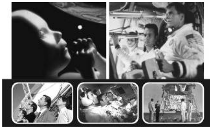
Figure 3. Highlight and Hoax: 2001, Apollo 13, Capricorn 1, Marooned, The Dish

In the 1980s, people questioned the trip to the moon after Hollywood launched 'Capricorn 1'. This movie tells the story of a supposed first manned trip to Mars; just before the launch, the crew is kidnapped and locked in a television studio, from where they will pretend to have arrived on Mars. When the astronauts realize that the rocket disintegrated in the air and that they shall be killed in order to cover up the fraud forever, they decide to flee, each one in a different direction in search for help (Figure 3).