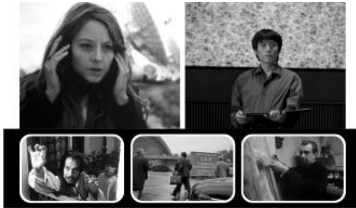
Figure 8. How to Portray an Astronomer and Biographies: Contact, Dark Matter, Kepler, The Promise, Galileo

‘The Promise’ by Margaret von Trotta, illustrates another case based on real life. The protagonist of the story is an astronomer expert in solar physics, and is separated from his wife and son by the Berlin Wall. Business trips will be an excuse for temporary reunions. In its storyline, some parts of the film are set at conferences that really took place, including the assembly of the International Astronomical Union in Prague in 1967.