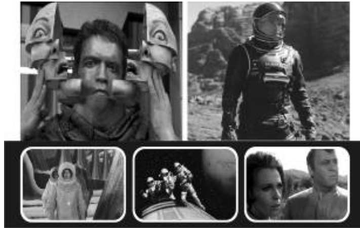
Figure 4. Destinations: Total Recall, Red Planet, The Illustrated Man, Mission to Mars, Flight to Mars