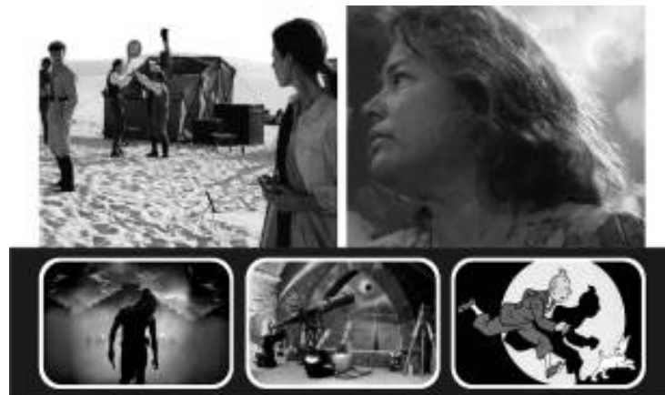
Figure 6. Eclipses: House of Sand, Dolores Claiborne, Tintin, The Eclipse, Apocalypto

Among the most breathtaking cosmic spectacles are total solar eclipses. Multitudes of eclipse hunters from around the world gather each time a total eclipse somewhere in the world is announced. In 'Dolores Claiborne', Kathy Bates uses the lack of witnesses and the momentary darkness to get rid of her abusive husband. An eclipse explains the appearance of a killer plant in the film 'Little Shop of Horrors', and is a very useful tool to provide the film with a credible ending, unlike, for example, that of 'When Dinosaurs Ruled the Earth'. In 'The Simpsons' an eclipse occurs just when a solar-powered monorail is out of control. In 'Tintin and the Temple of the Sun', Tintin and his friends are condemned to death and are saved by an eclipse. Something similar happens in 'Apocalypto' by Mel Gibson. In the Brazilian film 'House of Sand', the eclipse of 1919 is a protagonist of the story (Figure 6).