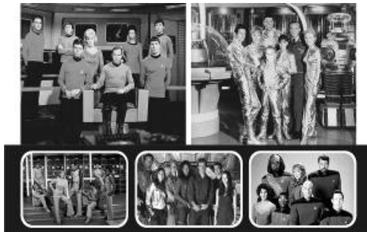
Figure 2. Travels and crews: Star Trek, Lost in Space, The Next Generation, Serenity, Space 1999

another classic, 'Flash Gordon'. The first film of this saga appeared in 1936, with a remake in 1980. Following the same trend, we find 'Battlestar Galactica', where a civilization at risk is led by Commander Adama to a distant planet where they will begin a new life. Pursued by the 'Cylons', 'Battlestar Galactica' travels during 'Centoni' to its new destination: a planet called Earth. Kids have their own tour through the cosmos with 'Zathura, A Space Adventure', a 'Jumanji'-style movie where each move of a table game faces the characters with a different astronomical event. Television also bowed to space adventures with classic series such as 'Lost in Space' (1965), 'Space 1999' (set on an out-of-orbit and drifting satellite station in a distant and futuristic 1999) and the classic 'Star Trek' saga, a pioneer in many ways, and mainly in technological terms (for example, the warp propulsion system (see Figure 2)).