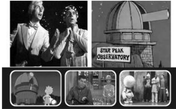
Figure 10. Astronomy in beat of comedy: The Meaning of Life , Pink Panther , The Hitchhiker's Guide to the Galaxy , Way...Way Out , The Simpsons .