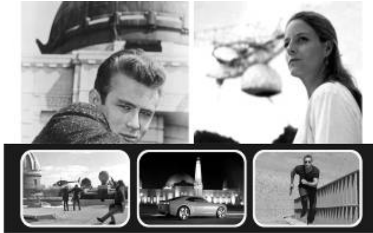
Figure 9. The Observatories: Griffith, Arecibo, VLT